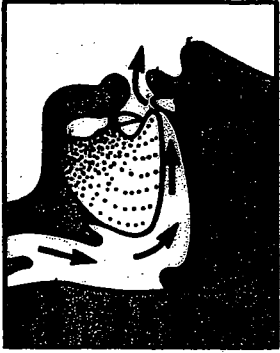
Dental [θ] and [ð]