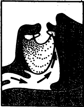
Alveolar [t] and [d]