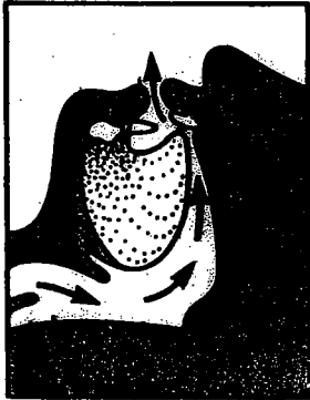
Alveolar [s] and [z]