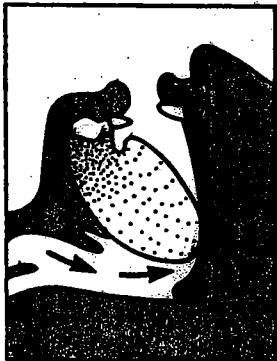
Velar [k] and [g], when followed by an [i] vowel