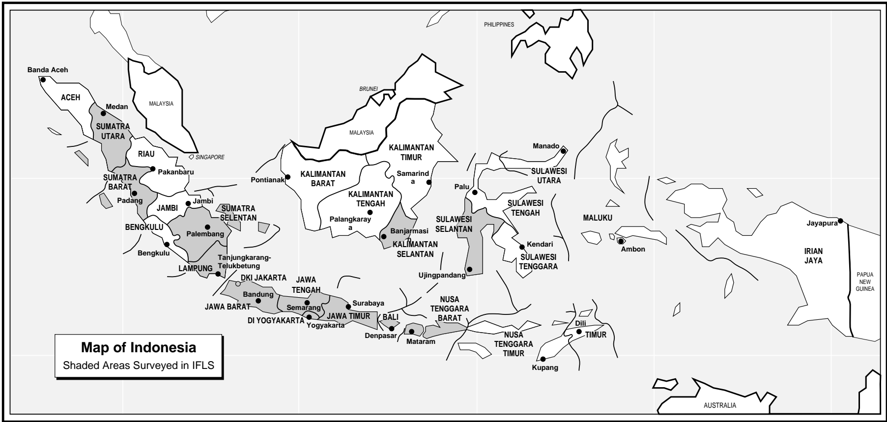
Fig. 1.1—Map of Indonesia